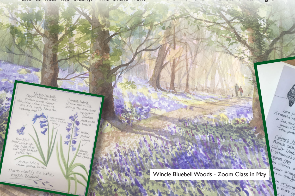
Windle Bluebell Woods - Zoom Class in May